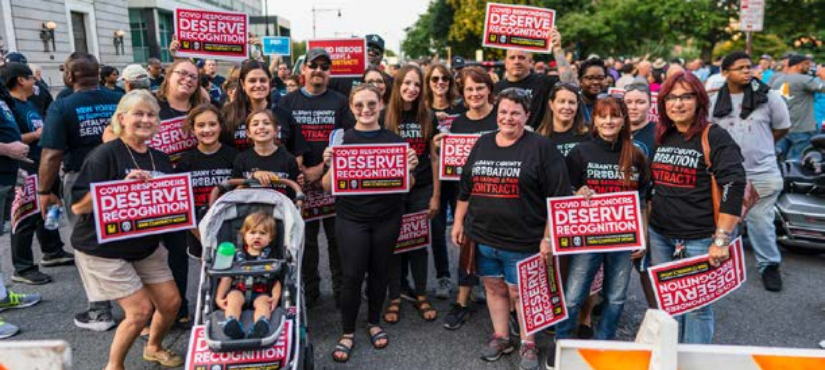
PEF members from Albany Co. Probation at the Labor Day parade on Sept. 9, 2022.